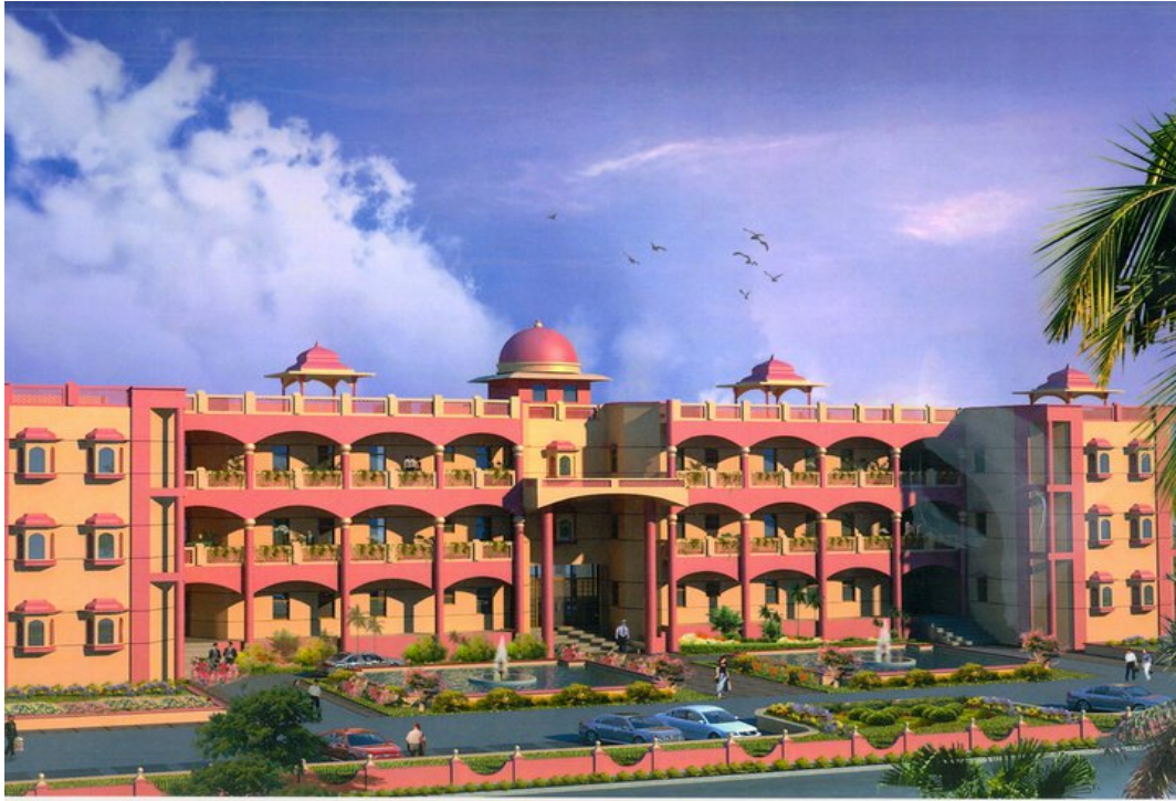
Upcoming IITTM centre at NOIDA.