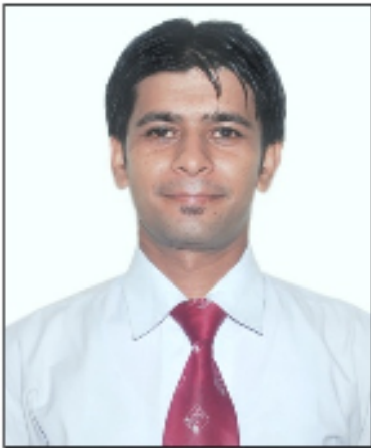
Neilkanth 23 Yrs